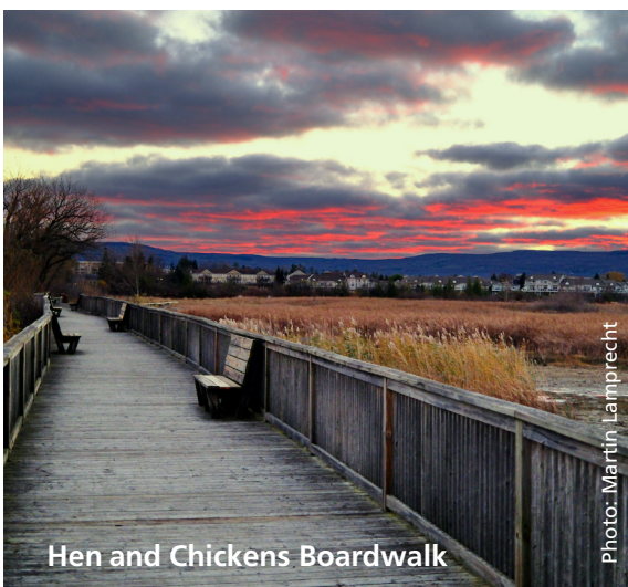
Hen and Chickens Boardwalk