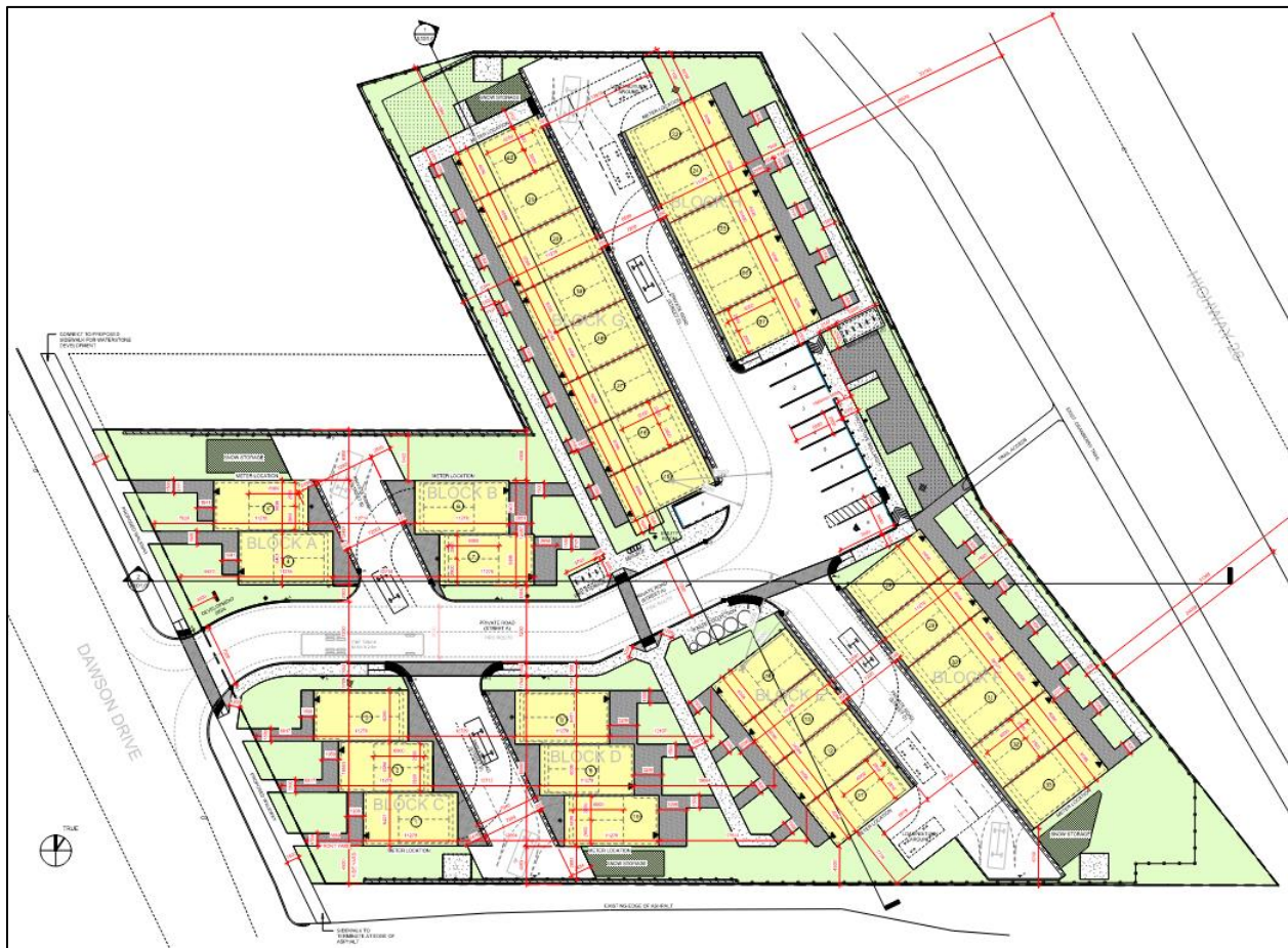
Figure 2: Proposed site plan.

The Site Plan drawings are appended to this Report (Appendix 'B'), noting that some further minor revisions are anticipated to address the outstanding technical comments.