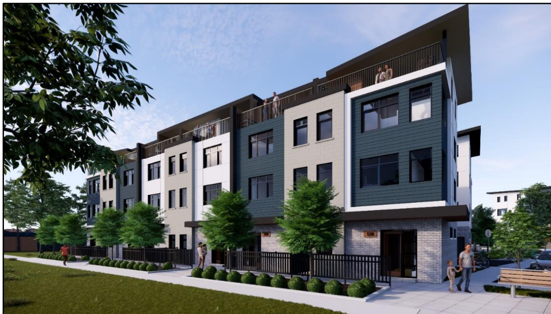
Figure 4: Artists rendering of units facing Highway 26 (Block F).