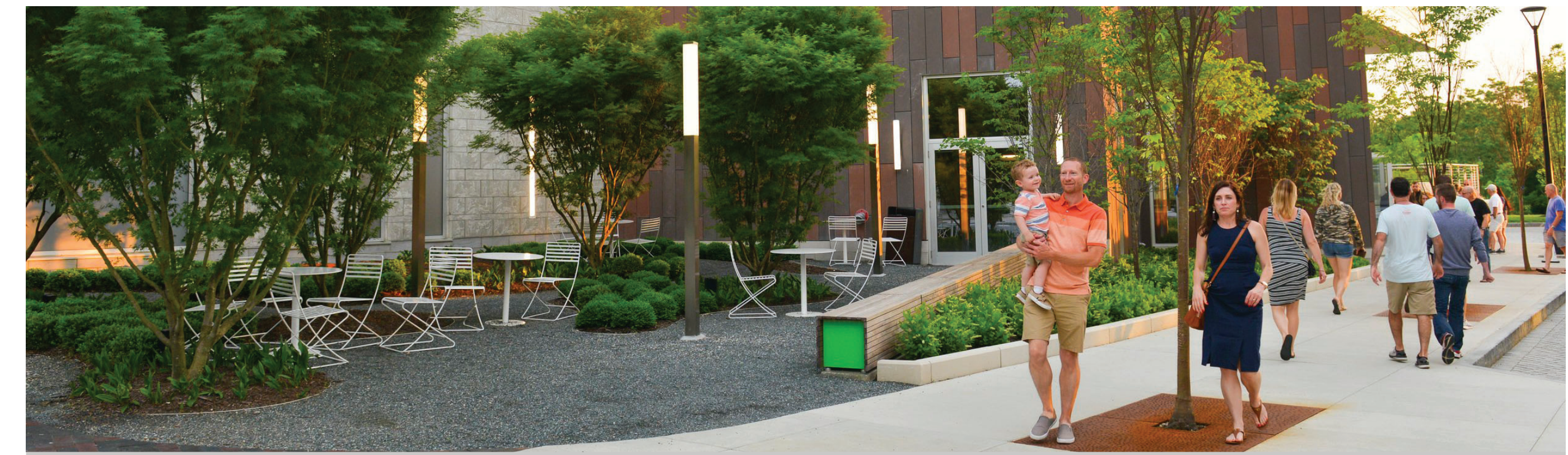
SPILL OUT AMENITY SPACES DESIGNED FOR SOCIALIZING AND CASUAL CONNECTION