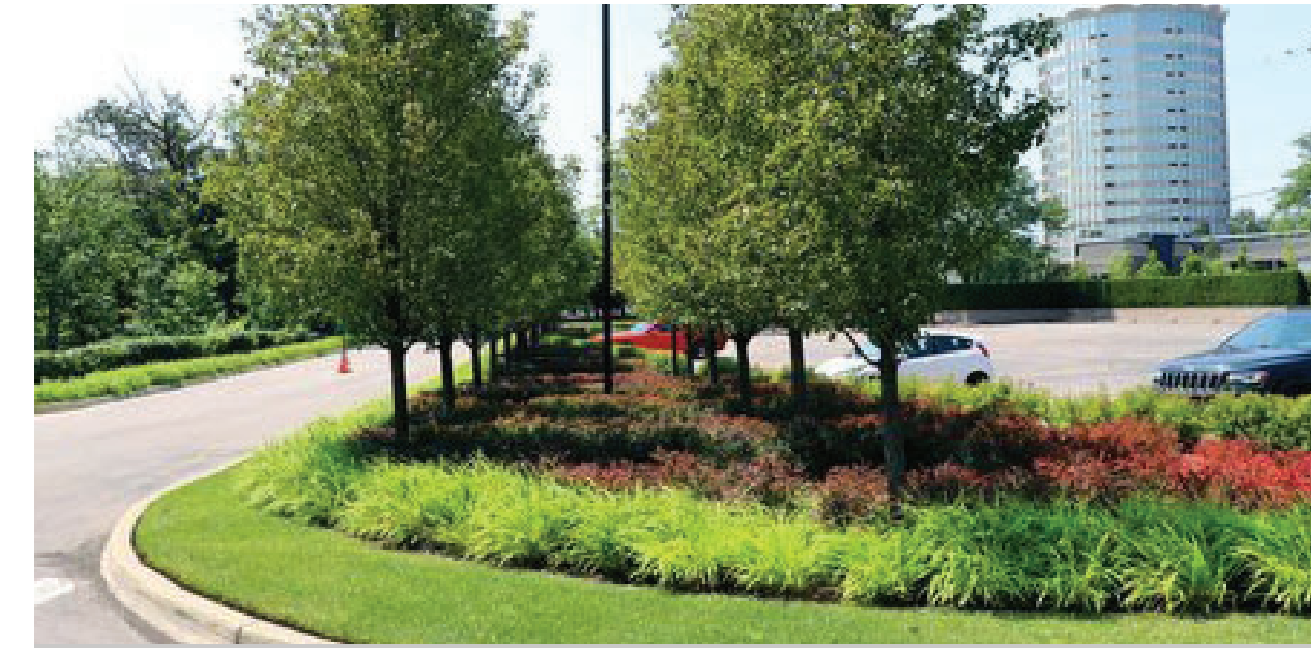
SCREENING OF PARKING & DRIVE-THROUGH