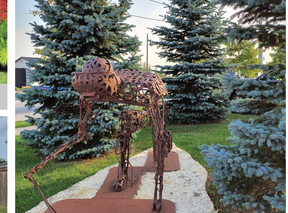
PUBLIC ART TO DEPICT LOCAL HISTORY, ACTIVITIES, NATURAL FEATURES, AND ARTISTS