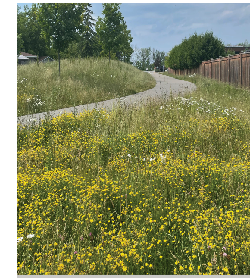
'BIODIVERSITY BELT' NATIVE LOW GRASS MEADOW MIXTURE