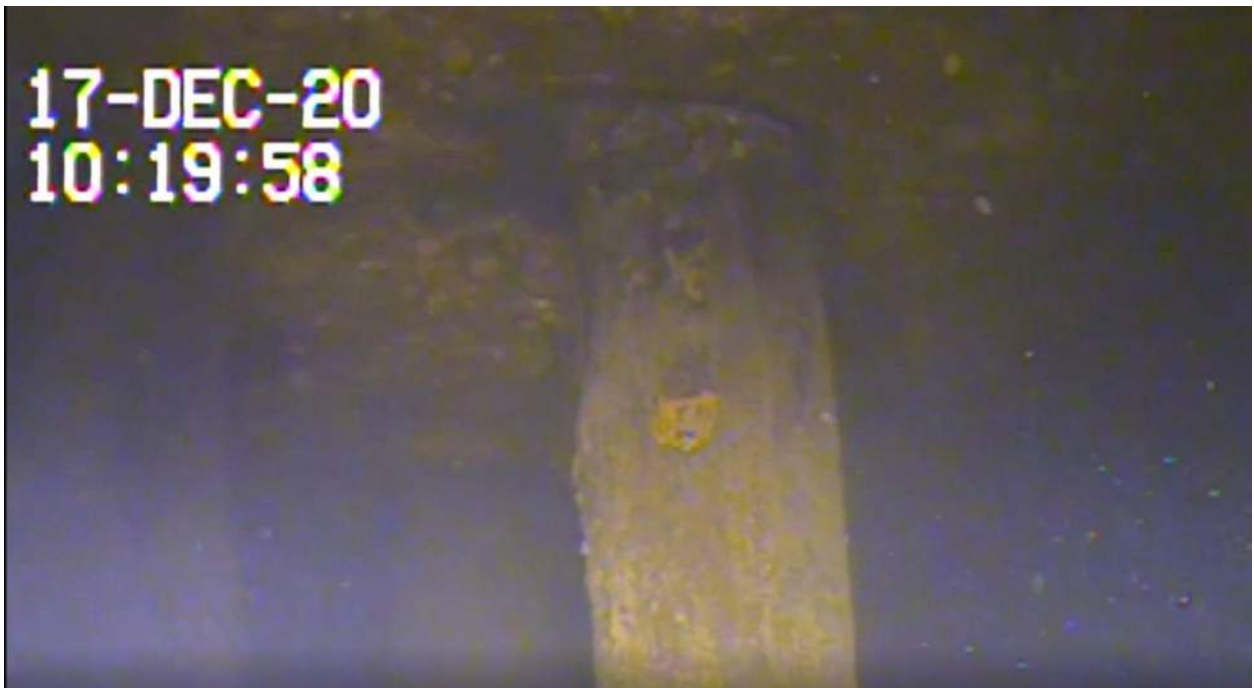
Photo with time stamp 10:19:58 illustrates a pile in relatively good condition which is fully engaged in the concrete wharf slab above.

Based on the diver and ROV survey, approximately 50% of the piles reviewed had visible deterioration. The deterioration ranged from relatively minor surface decay (less than 1" deep) to complete pile decay.