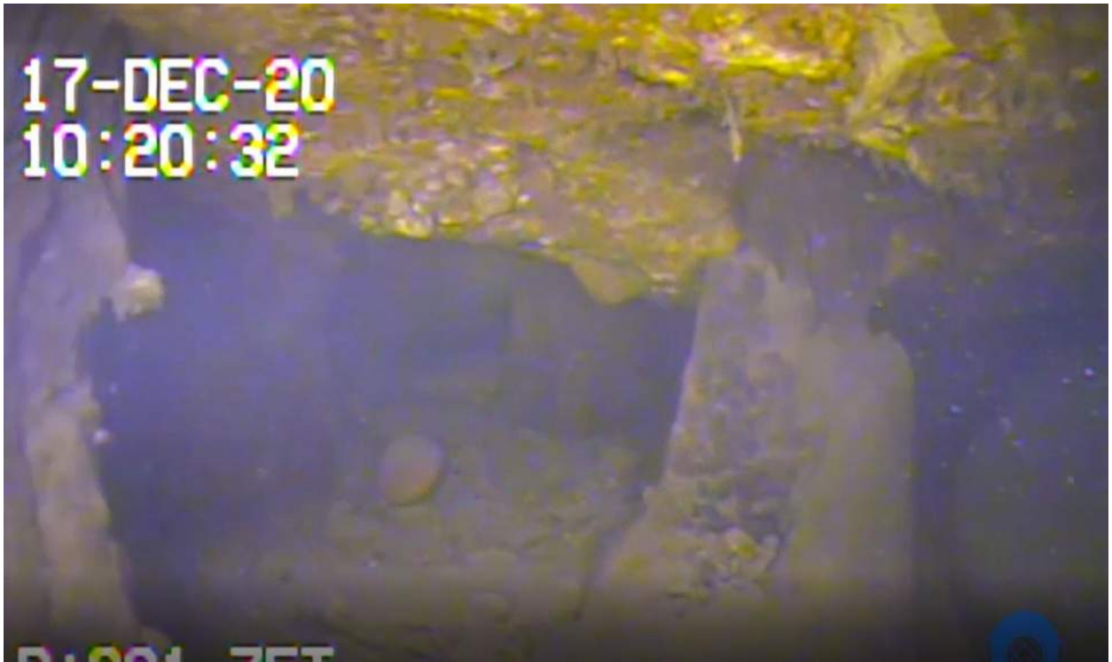
Photo 10:17:40 illustrates 3 adjacent piles where the top of the pile has completely decayed and is no longer in contact with the wharf slab above.

Photo 10:20:32 illustrates a pile with significant deterioration where over 75% of the pile section is completely decayed.