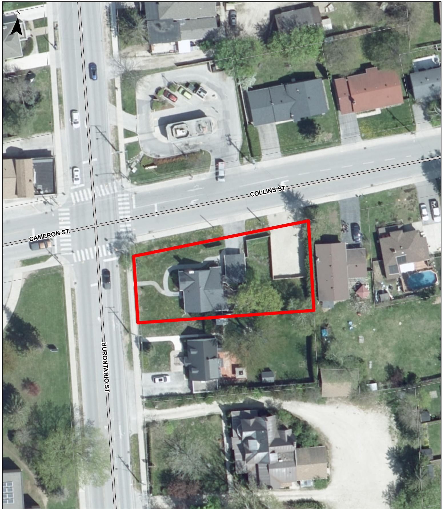
Figure 1 Location (Aerial) 629 Hurontario St Town of Collingwood