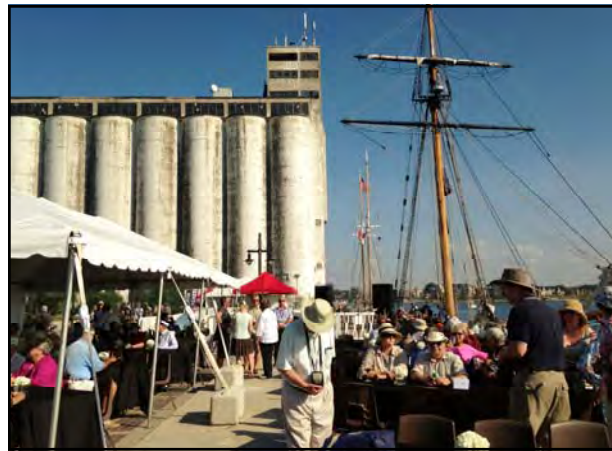
One hundred history enthusiasts enjoy a beautiful evening in one of Collingwood's most scenic locations, complete with a gourmet meal, drinks, music, ship tour, and a special lecture.