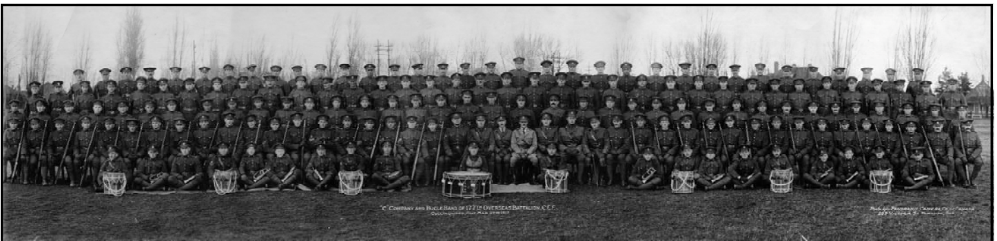
"C" Company and Bugle Band, 177th Overseas Battalion, C.E.F., Collingwood, Ontario, March 27, 1917

Once again the Collingwood Museum will be partnering with Gaslight Tour to bring Collingwood's history to life over four days in November. Last year's theme, Launching a Legacy , was very well received and the local talent demonstrated in each performance was truly astounding.