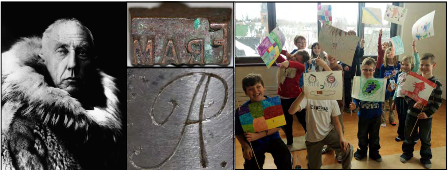
Left to right: Norwegian Explorer Roald Amundsen, a metal branding iron from Amundsen's vessel Fram , Amundsen's initials ("R" and "A") on a tin cup, and participants in the Museum's Eccentric Explorers P.A. Day program on January 31st.

Relating to the life of an individual who lived 100 years ago is often difficult; attempting to understand the life and exploits of an early 20th century explorer is a different challenge altogether.