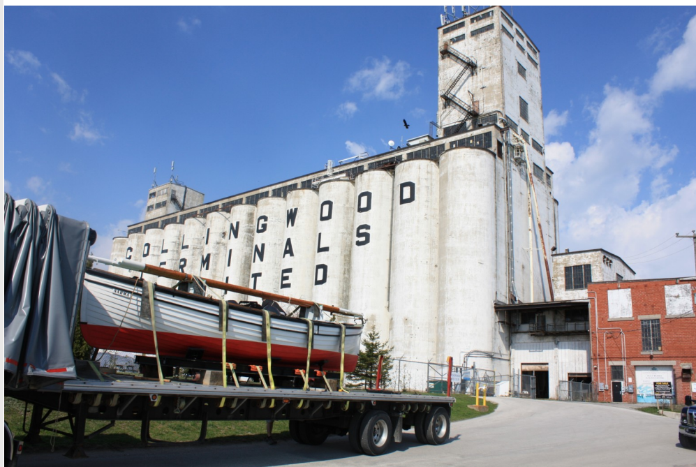
The Watts-built vessel Nahma awaits transport to its new home in Ottawa on May 1st.

Community members took advantage of a unique opportunity to participate in the transfer of Nahma , a Collingwood-built vessel of national significance, to the Canada Science and Technology Museums Corporation (CSTMC) on April 30 th and May 1 st .