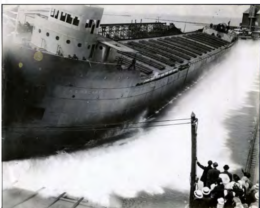
Launch of J.H.G. Hagarty, 1914